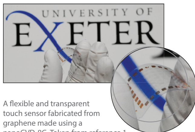
A flexible and transparent touch sensor fabricated from graphene made using a nanoCVD-8G. Taken from reference 1.