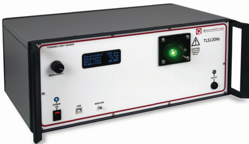
TLS120Xe with manual front panel controls active.