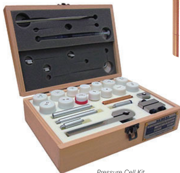
Pressure Cell Kit