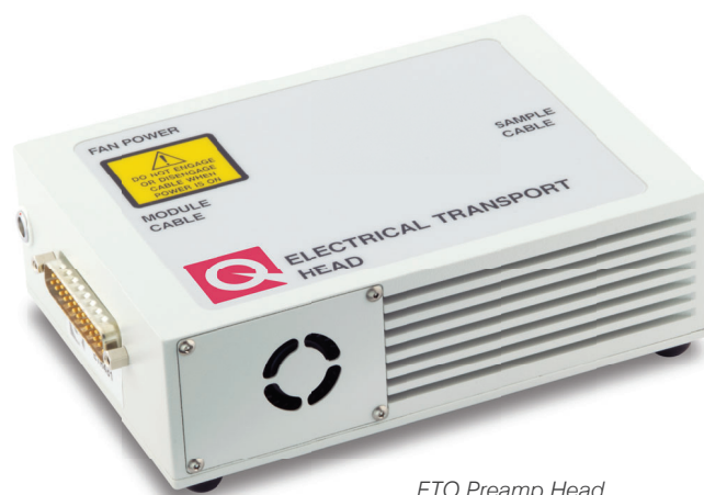
ETO Preamp Head

Specifications are subject to change without notice.